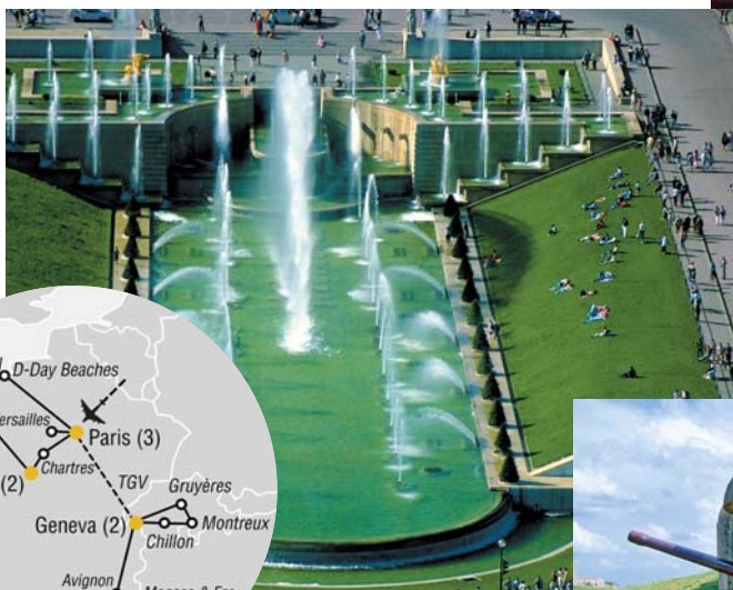
Enjoy views of the beautiful fountains of the Palais de Chaillot.